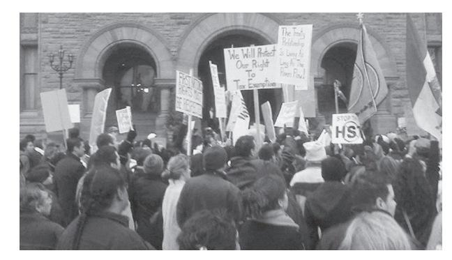
First Nations-led HST protest

According to a June 2nd press release issued by the Union of Ontario Indians, several First Nations have served notice that they will be setting up toll booths to slow traffic on the TransCanada Highway and to block rail traffic through their territories this summer.