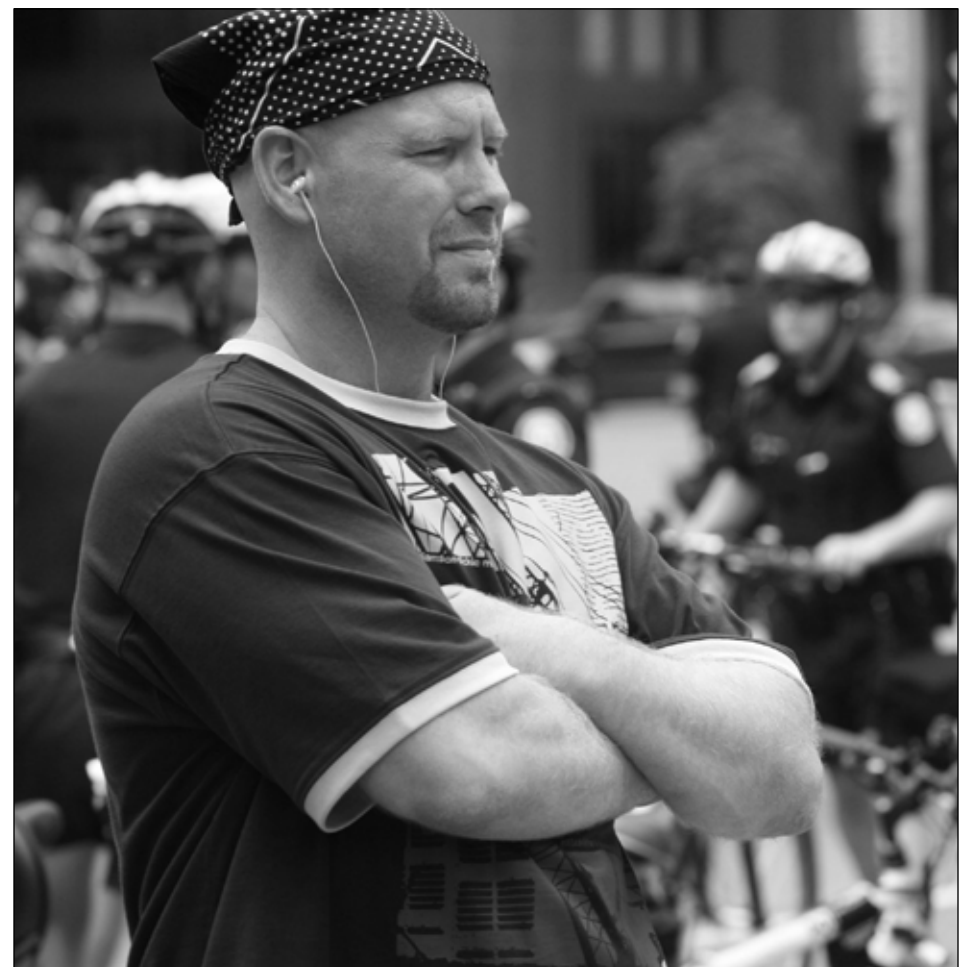
No, you don't look like an undercover officer at all!

But Scofield fears the G20 will only make things worse for the poor. "I think it's going to getting a lot meaner over the next 20 years. The IMF, G20 are calling for 20 years of austerity," she said.